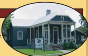
The Brazier Watkins House Current location of the River Road African American Museum

DIRECTIONS: From New Orleans: Take I-10 West to Exit 182, turn left; From Baton Rouge: Take I-10 East to Exit 182, turn right; Go to Hwy 70 caution light and turn left; Cross the Sunshine Bridge; Take Hwy 1 to Donaldsonville; Turn right at Railroad Avenue; Turn right onto Charles Street.